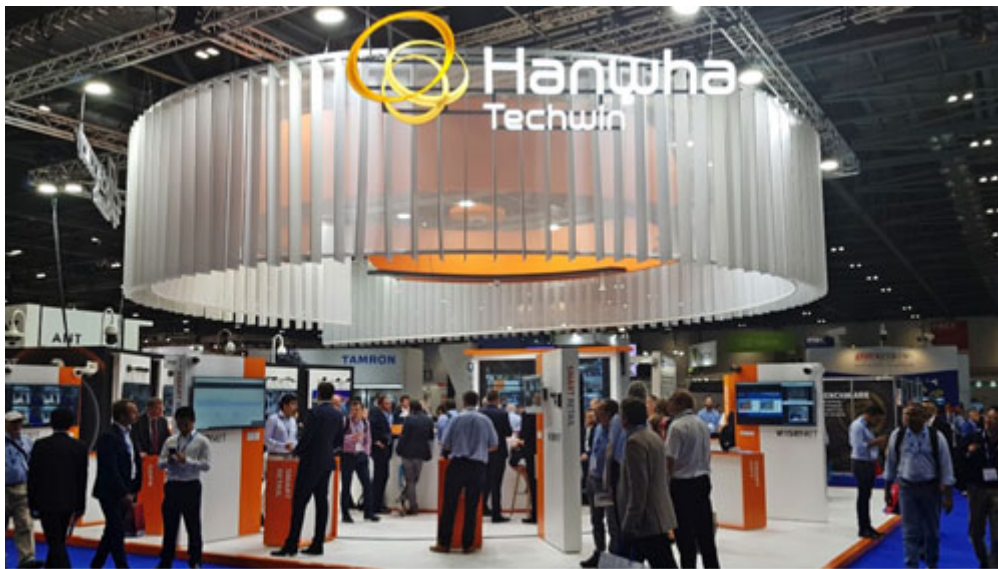
Hanwha Techwin participated in 'IFSEC International 2018' by showcasing smart solutions including smart city, smart retail, smart transport.

Hanwha Techwin demonstrated smart solutions including smart city, smart retail, smart transport, etc.